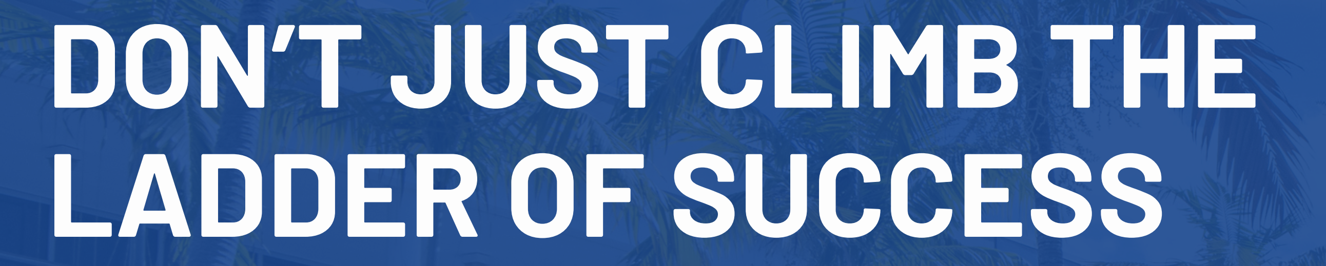
Chart a new path! The idea is not just to survive but to THRIVE!